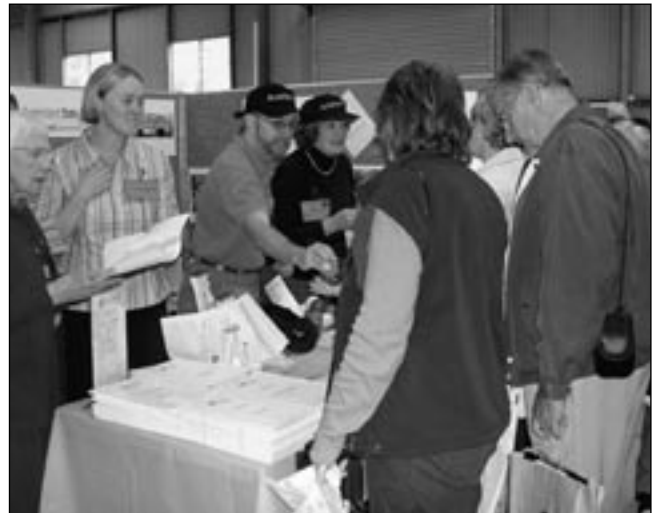
ALL THE FUN OF THE FAIR – Queensland State Archives' stand at the Family History Fair

Year of the Built Environment 2004 OUR BUILT HERITAGE