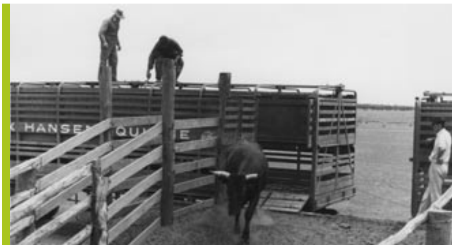
Make sure on your next visit to Queensland State Archives you take a look at "In the West", an exhibition which looks at records relating to life in Queensland's west.