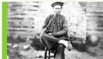
QSA Item ID 435753.

A seminar to celebrate Harmony Day recognising the importance of multiculturalism in Queensland's history. This seminar will focus on records relating to Chinese immigration and their contribution to Queensland history.